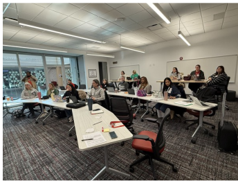
Secondary Counselor Cohort listen to the PBL Coach at Indian Hill discuss PBL.