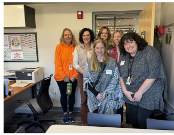
Elementary Counselor Cohort Visit Indian Hill Primary School.