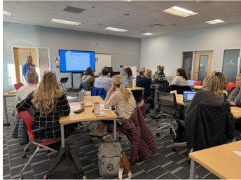
Curriculum Leader Cohort learn about cooperative learning and student engagement.