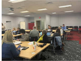
Elementary Principal Cohort engage in discussion about student behavior and get strategies from HCESC behavior and wellness directors.