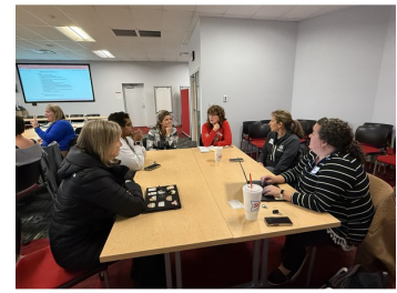
Instructional Coaches Cohort engage in discussion about reading interventions.