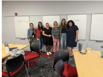
Elementary Counselor Cohort