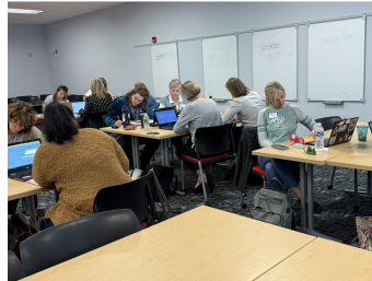
Instructional Coaches Cohort