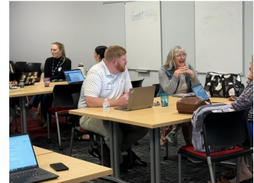
Secondary Counselor Cohort