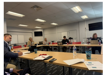
Student Services/Special Education Leader Cohort