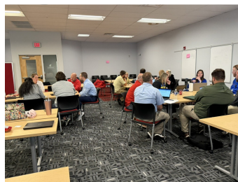
Assistant Principal Cohort