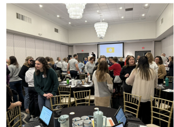
Ice Breaker activity to get to know others