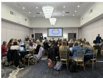
Creating Magical Moments in the Middle